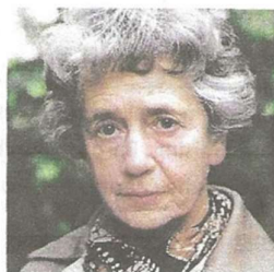
DAME PEGGY ASHCROFT